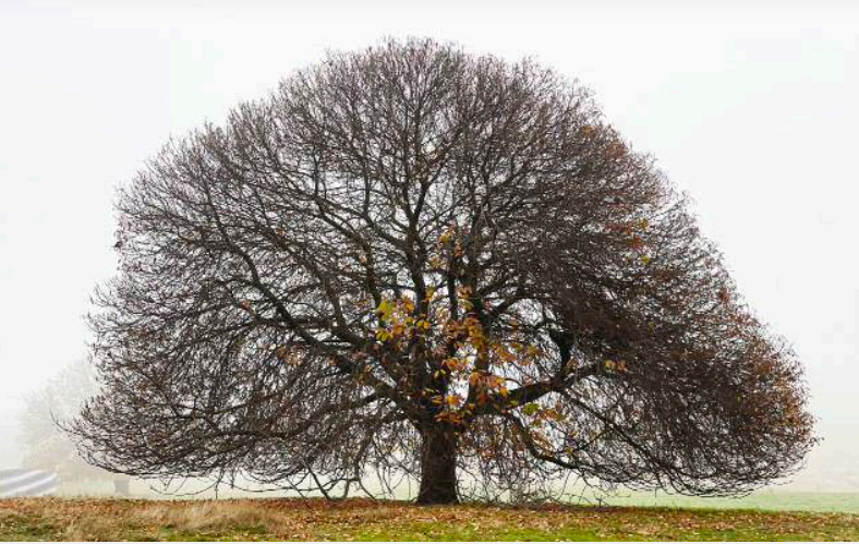
MAGNIFICENT STANLEY CHESTNUT TREE. THIS REGION IS THE MOST INTENSIVE CHESTNUT GROWING AREA IN AUSTRALIA.